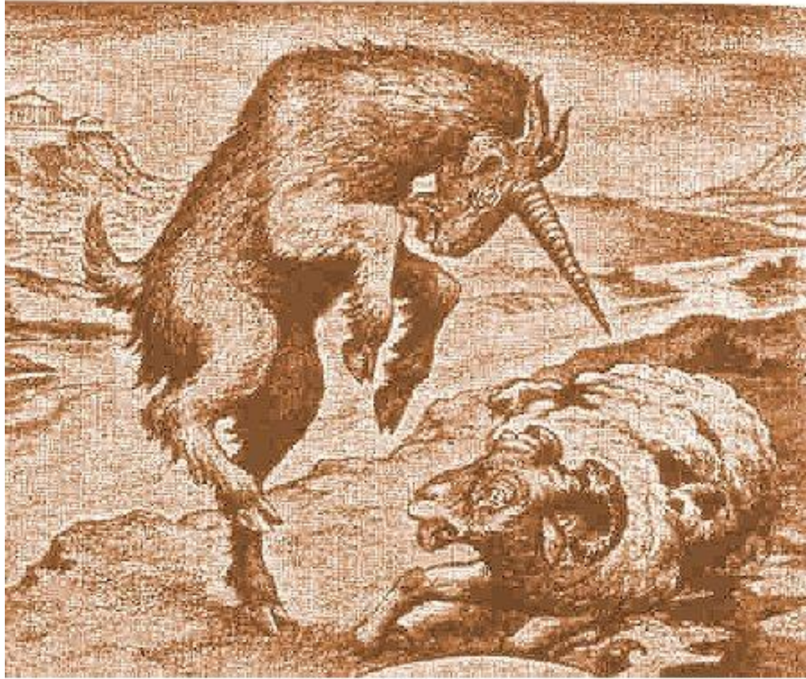
"The Ram and The He Goat" Public domain / copyright expired